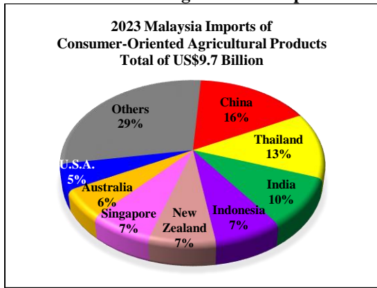
Top Exporting Countries to Malaysia